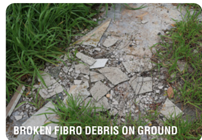
BROKEN FIBRO DEBRIS ON GROUND