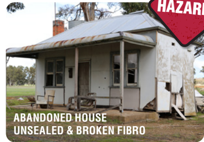
ABANDONED HOUSE UNSEALED & BROKEN FIBRO