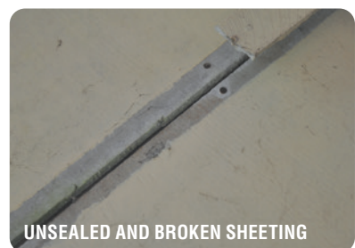
UNSEALED AND BROKEN SHEETING