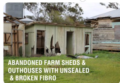
ABANDONED FARM SHEDS & OUTHOUSES WITH UNSEALED & BROKEN FIBRO