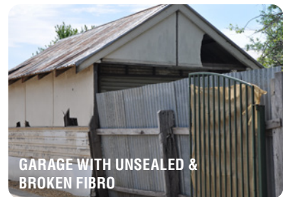
GARAGE WITH UNSEALED & BROKEN FIBRO