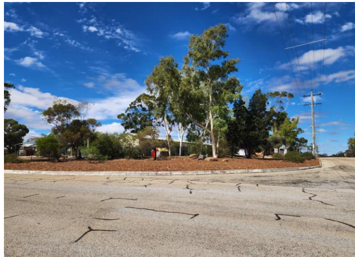
Photo: Mulching Works within the Town site.