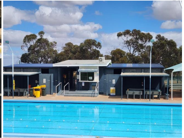
Photo: Swimming Pool Changerooms Cover