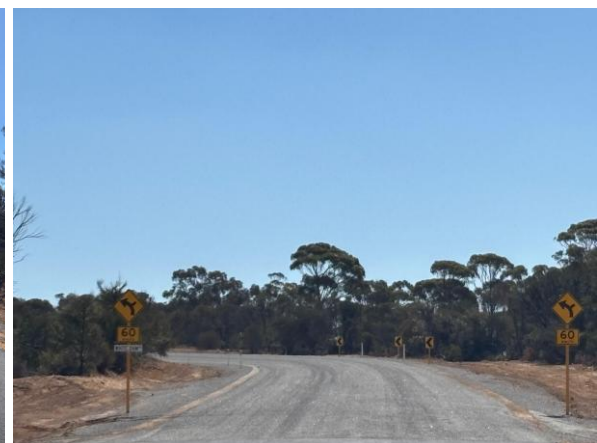
Photo: Cemetery Rd