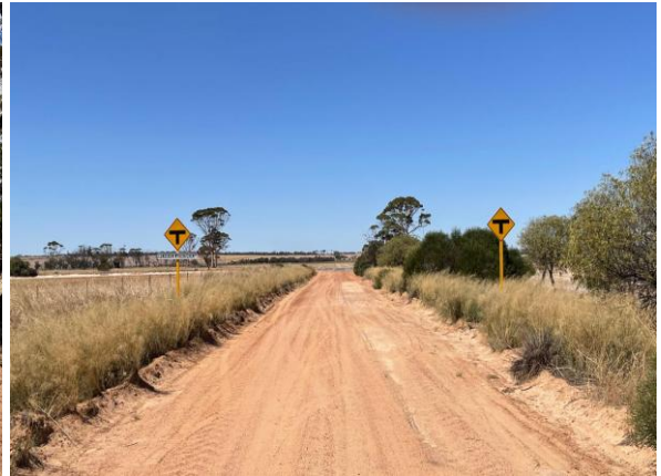
Photo: Cunderdin - Wyalkatchem Rd