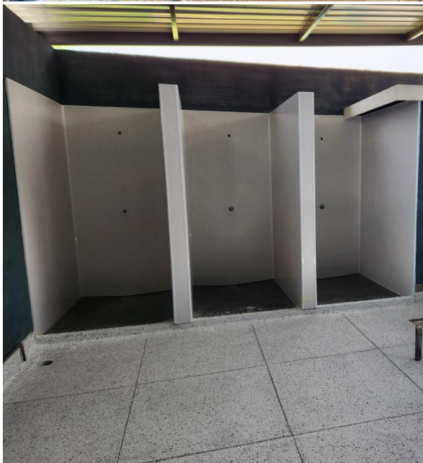
Photo: Swimming Change Rooms Restoration