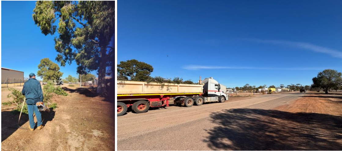
Photo: Verge Cleaning Works within the Town site.