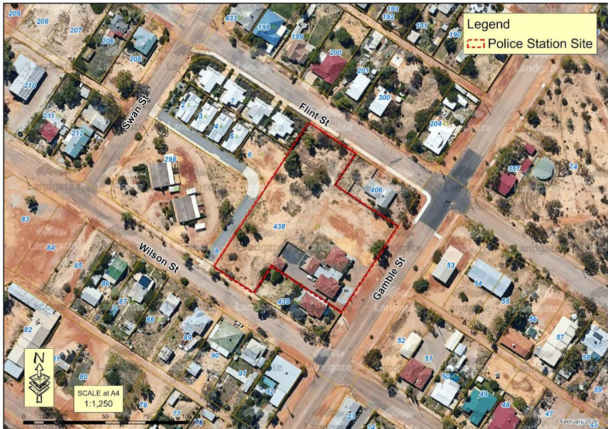
FIGURE 1 – AERIAL PHOTOGRAPH OF POLICE STATION SITE

The management orders are vested in the Commissioner of Police. The Council has approached the Commissioner with a view to reducing the area of the Reserve required by the police to enable the Council to provide for more housing in the town. The land is well serviced and within close proximity to existing facilities and amenities.