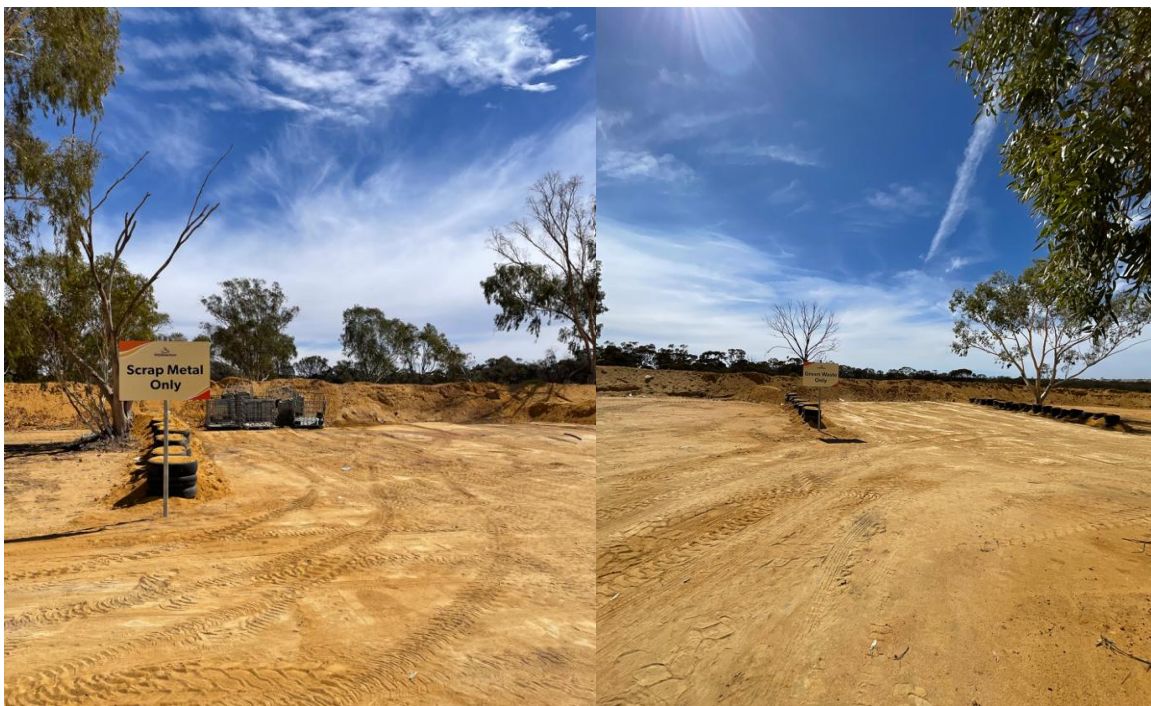
Photo: Refuse Site, New signage & layout