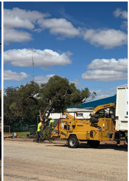
Photo: Tree Pruning Works within the Town site.