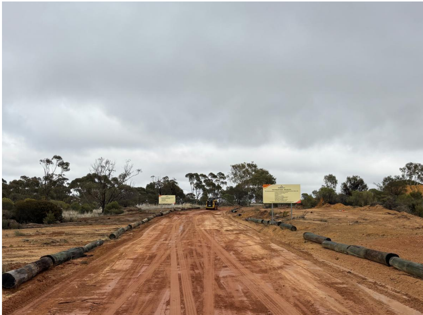
Photo: Refuse Site Entrance