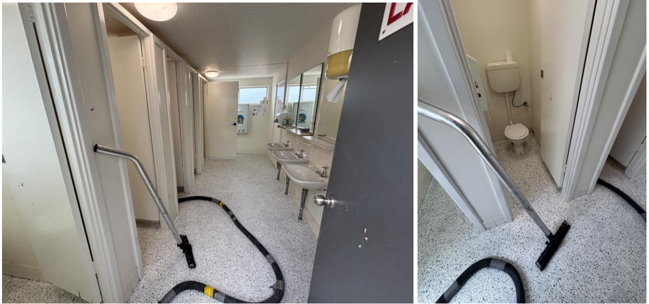
Photo: Recreation Centre Toilets